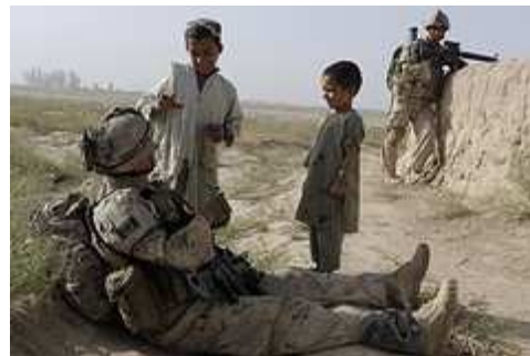
(Afghan locals greet 1 Royal Canadian Regiment Bravo Company personnel while they patrol the area in Kandahar, 3 June)

While Harper talked tough with NATO on Arctic, US believed PM all bark no bite , APTN National News , 11 May - Prime Minister Stephen Harper personally warned NATO's secretary general to keep the alliance out of the Arctic or risk increasing tensions with Russia, according to "confidential" US diplomatic cables